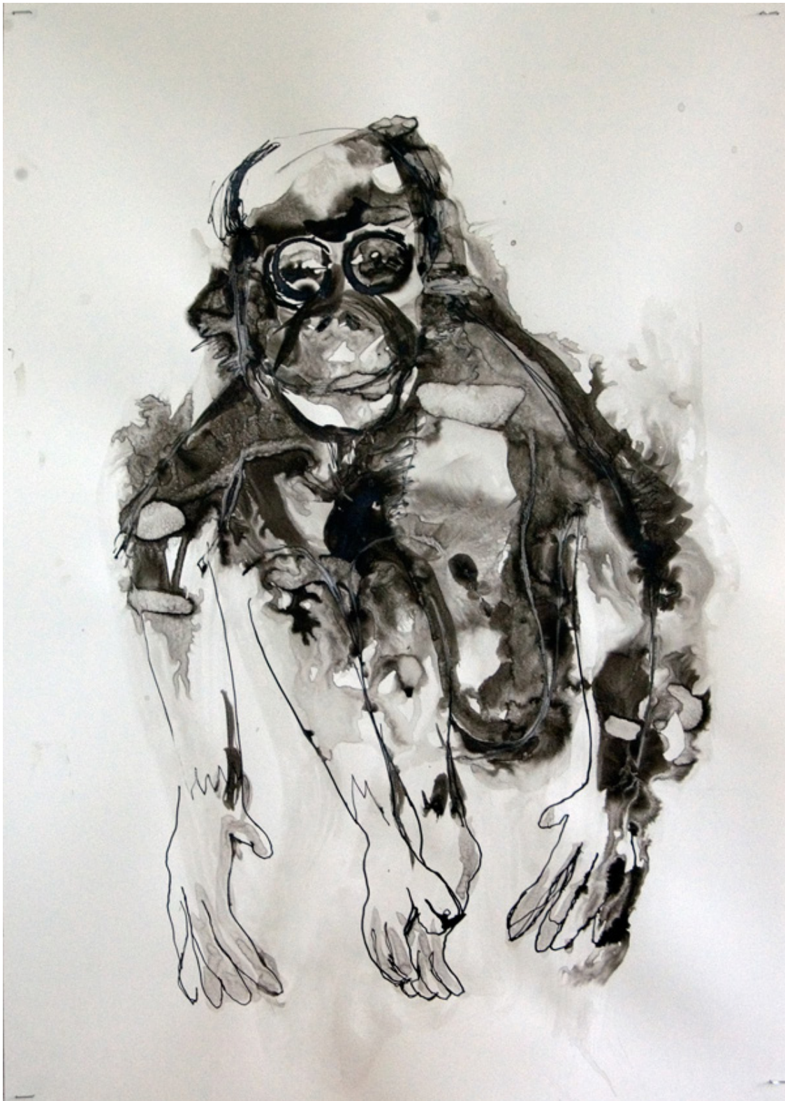
Dead Orangutan, 2017 ink on paper, 70 x 50 cm