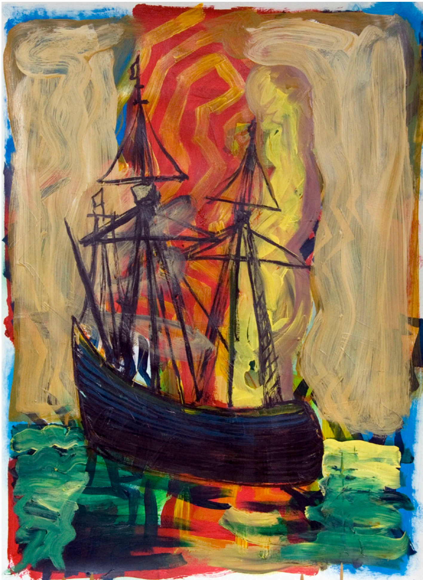
Dark Ship, 2018 acrylic on paper, 120 x 100 cm