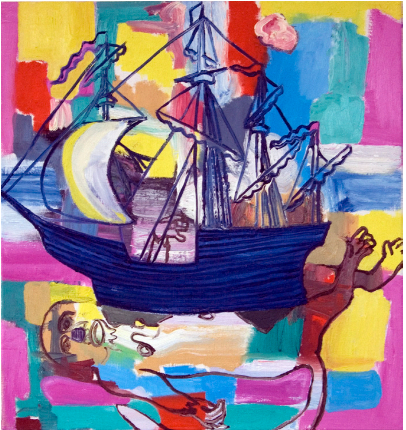
Age of Discovery, 2018 oil on canvas, 85 x 80 cm