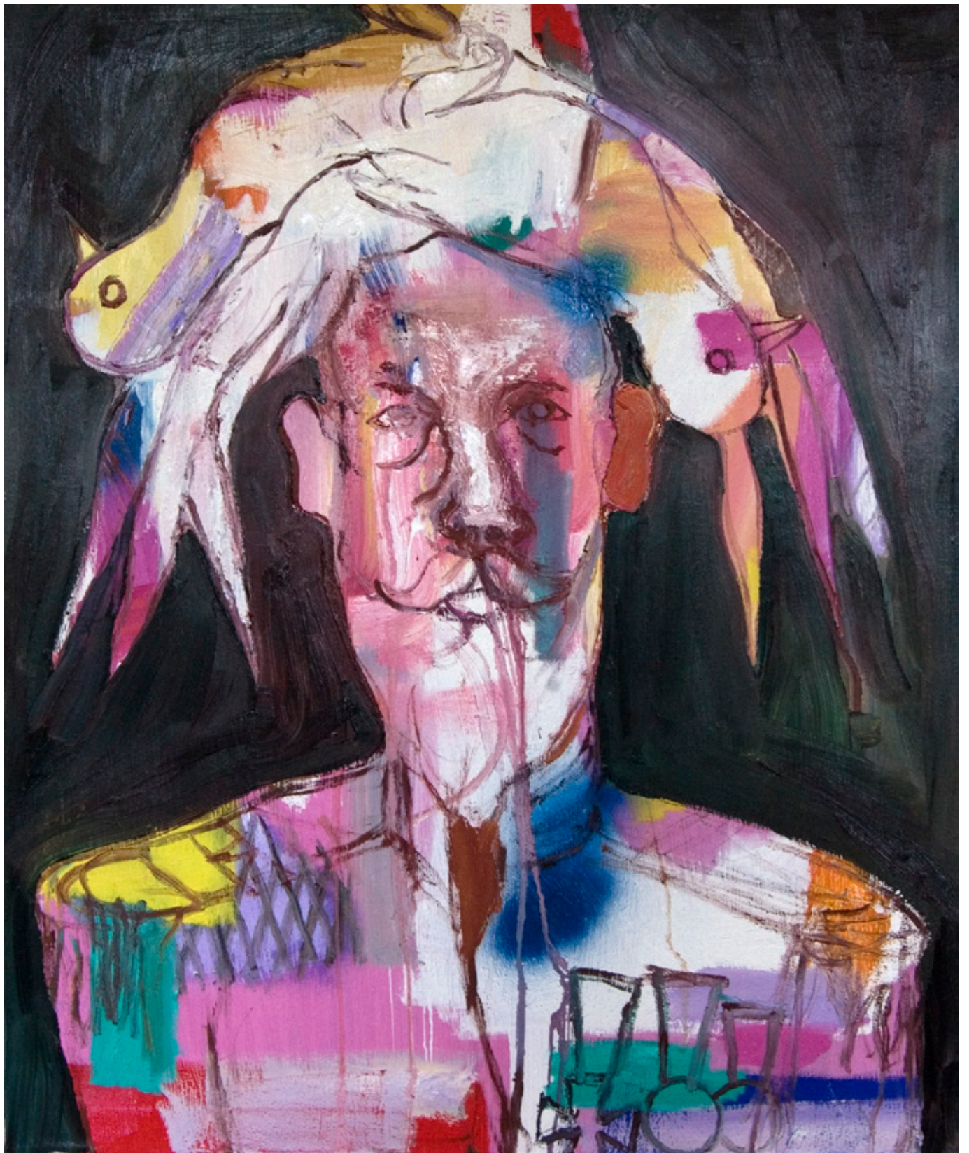
Der Kaiser, 2019 oil on canvas, 90 x 75 cm