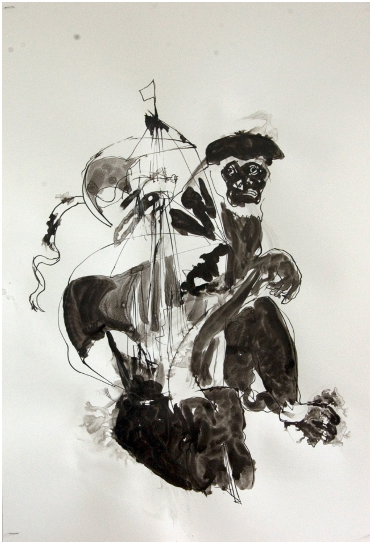
Ship and Monkey, 2018 ink on paper, 70 x 50 cm