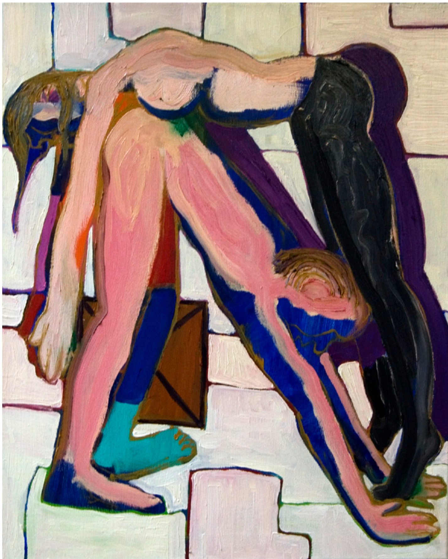
Night Games , 2019 oil on canvas, 80 x 65 cm