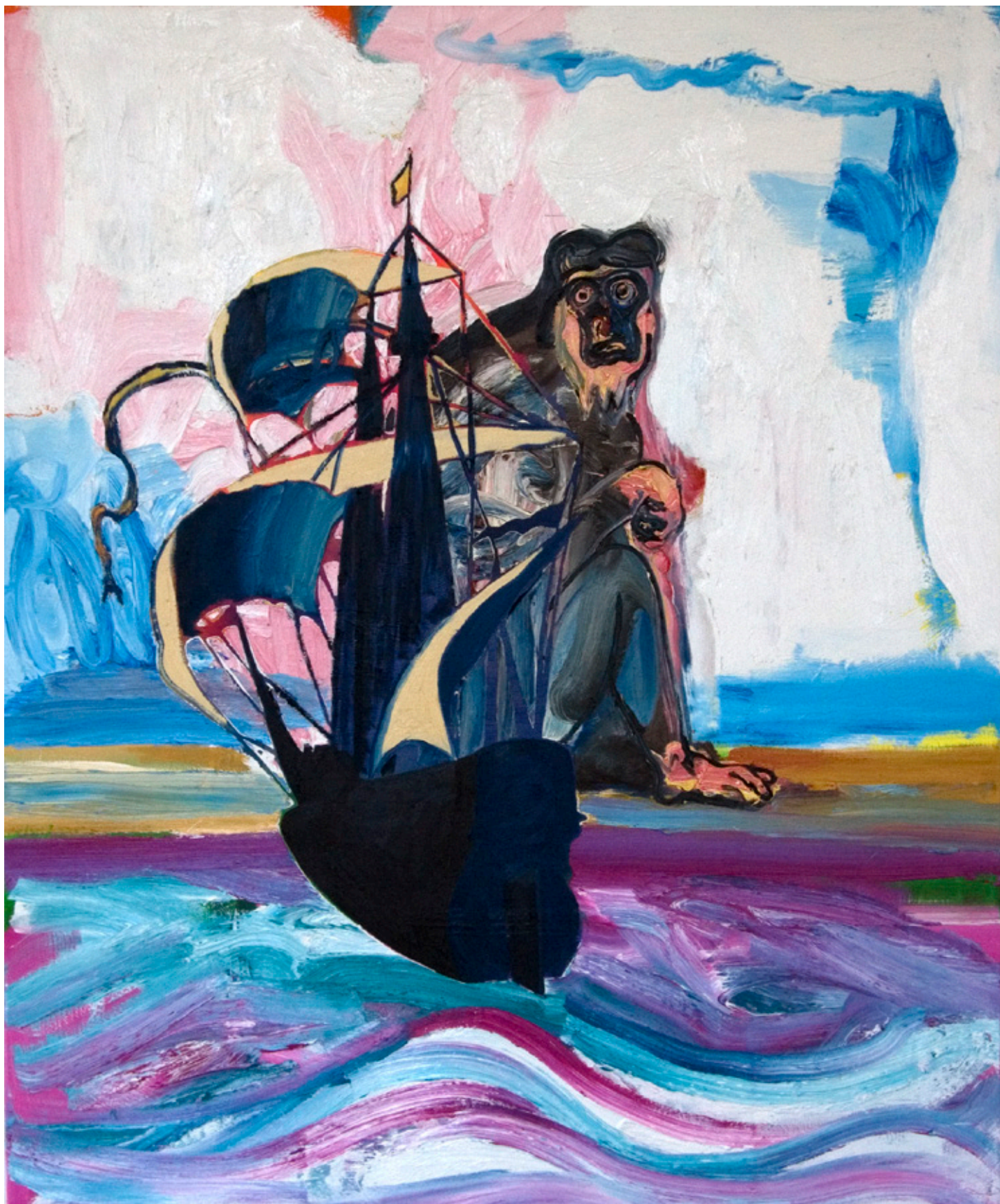
Ship and Monkey, 2018 oil on canvas, 120 x 100 cm