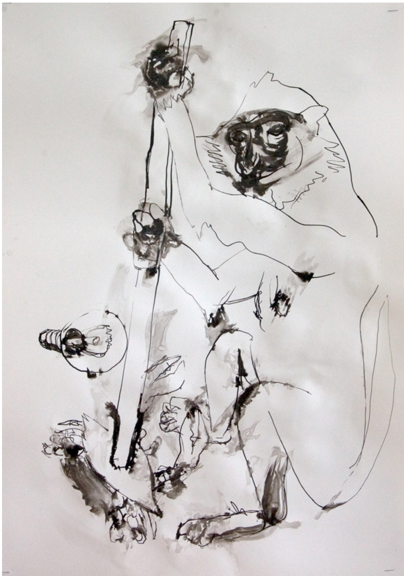
Monkey and Crab, 2018 ink on paper, 70 x 50 cm