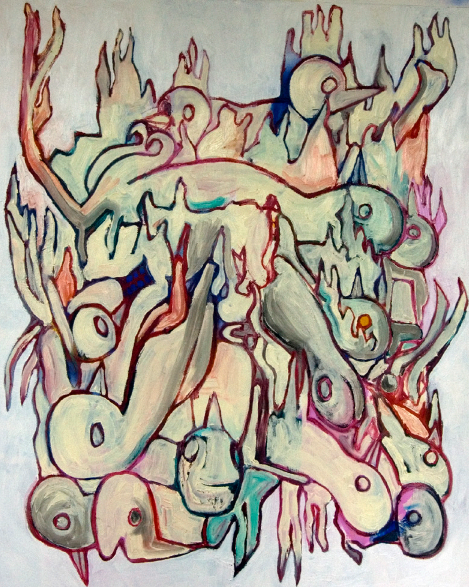
LAWRENCE WELLS Paintings 2019