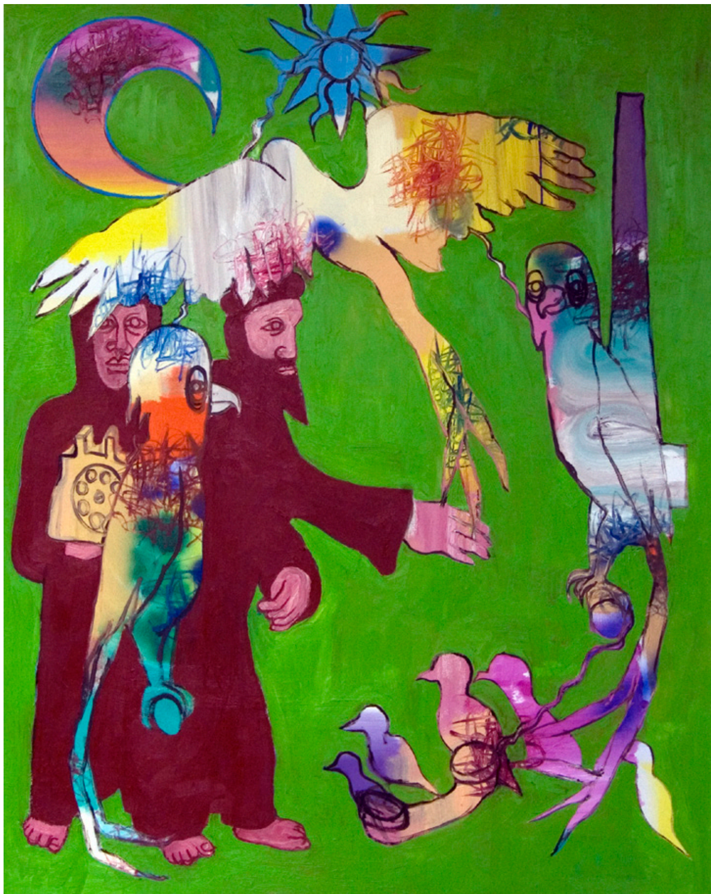
St. Francis and the Birds, 2018 oil on canvas, 150 x 120 cm