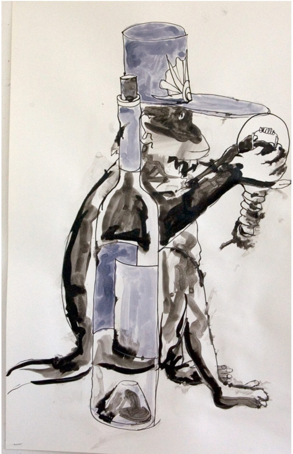
Monkey, Bottle, Light Bulb, 2018 ink on paper, 70 x 50 cm