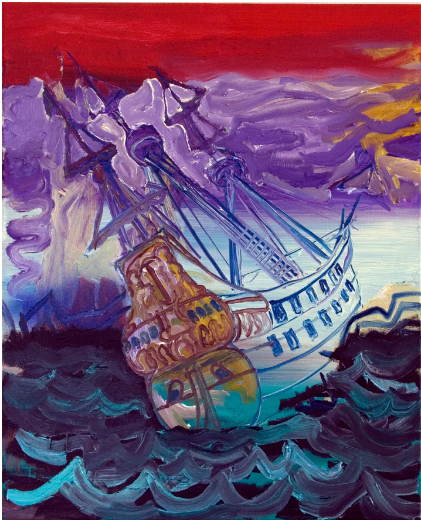
Dutch East India Ship, 2018 oil on canvas, 80 x 65 cm