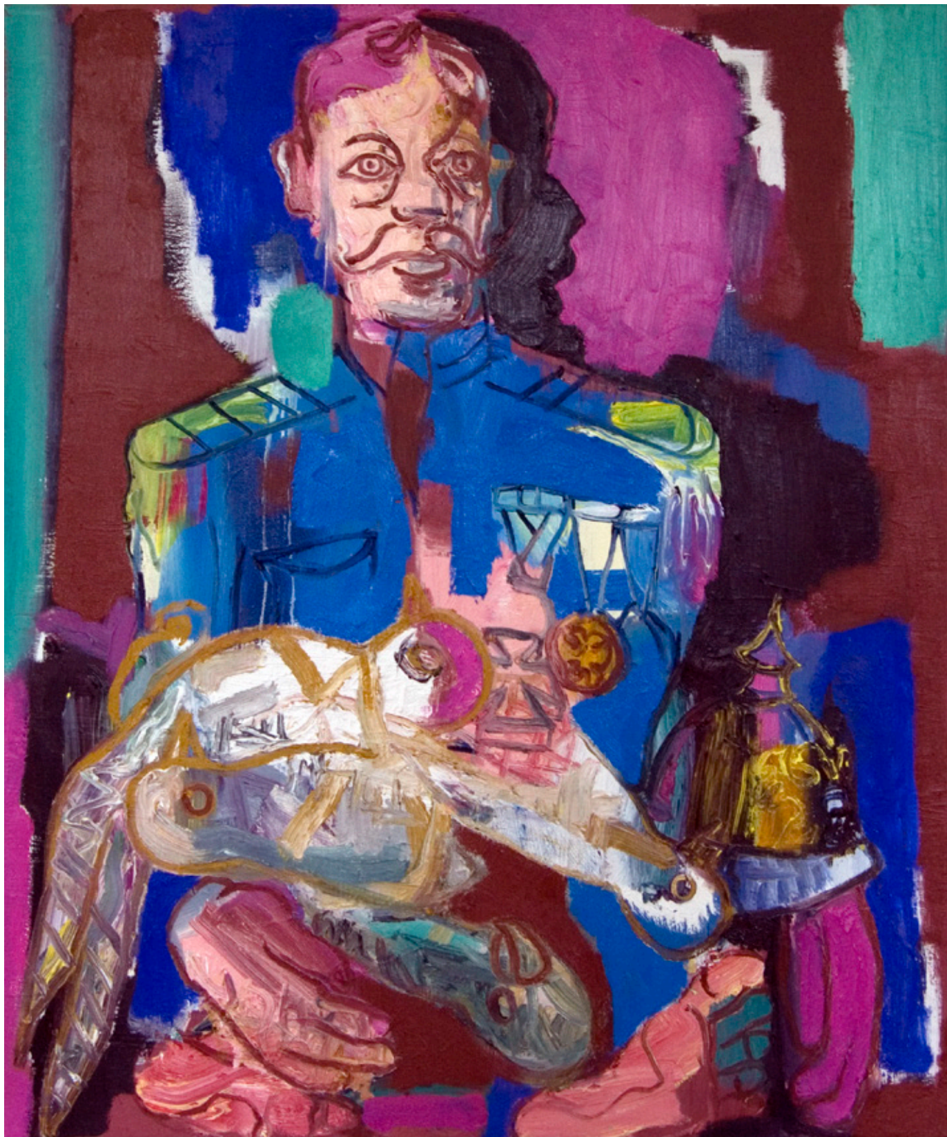
The General , 2019 oil on canvas, 90 x 75 cm