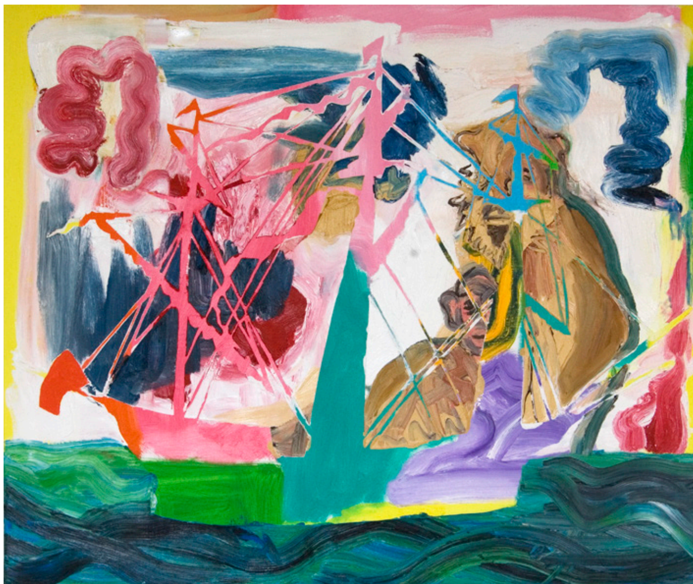
Ghost Ship, 2018 oil on canvas, 100 x 120 cm