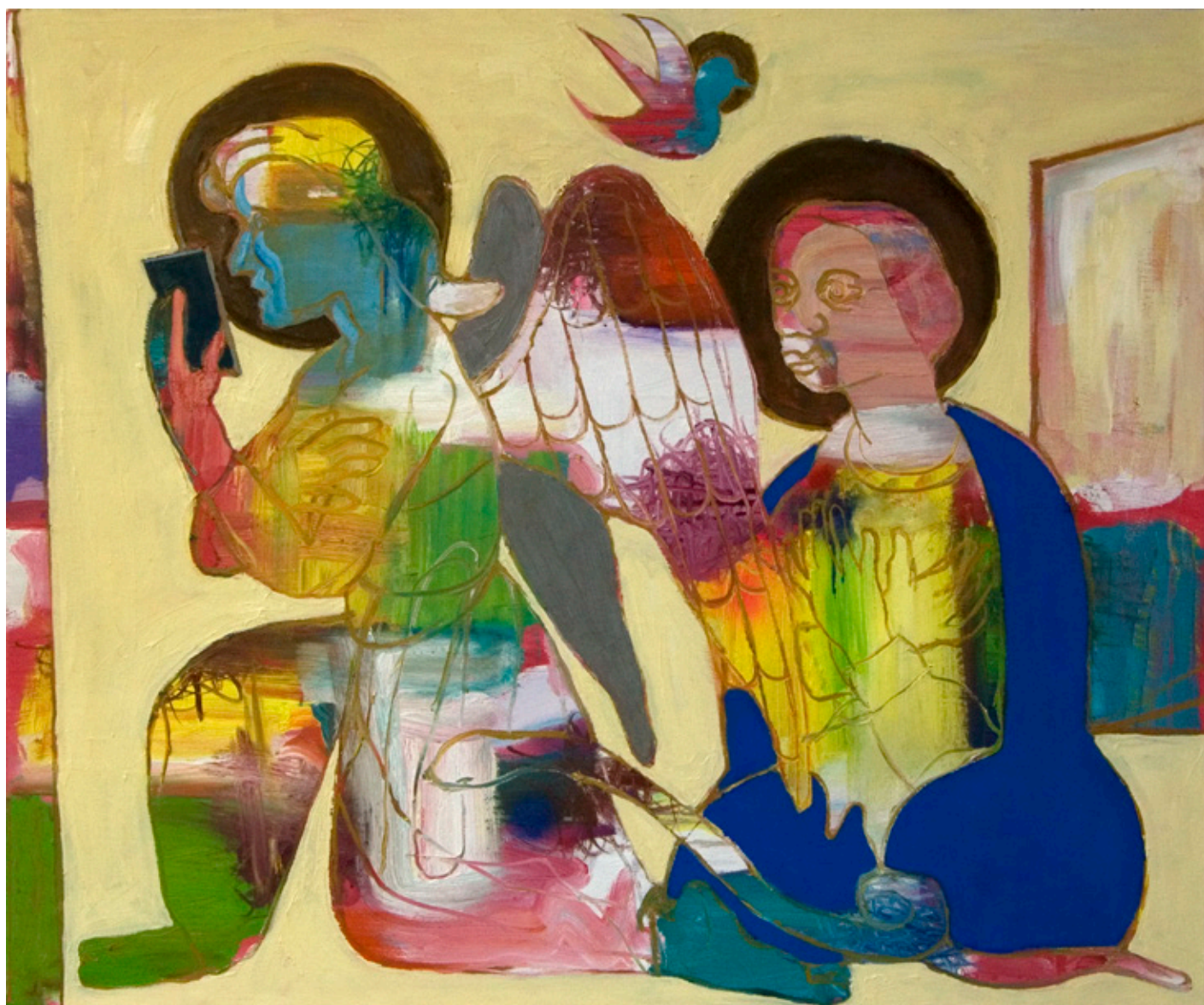
The Annunciation, 2019 oil on canvas, 100 x 120 cm