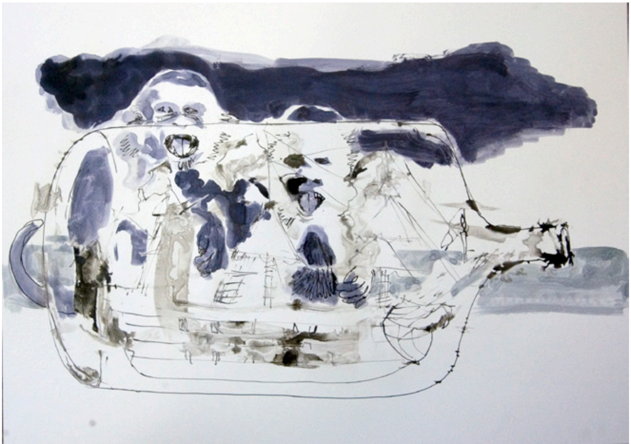
Ship in a Bottle, 2017 ink on paper, 50 x 70 cm