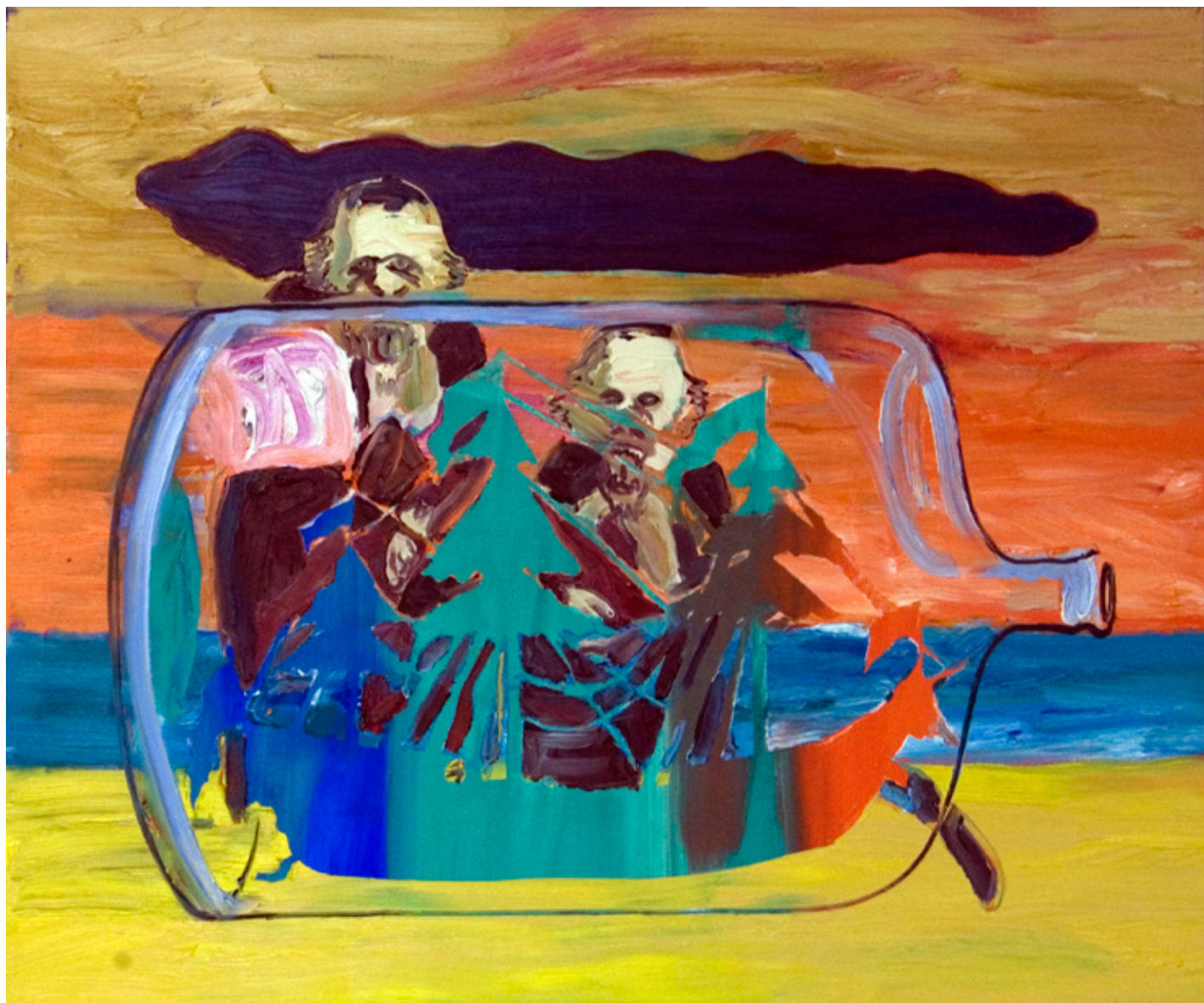
Ship in a Bottle, 2017 oil on canvas, 100 x 120 cm