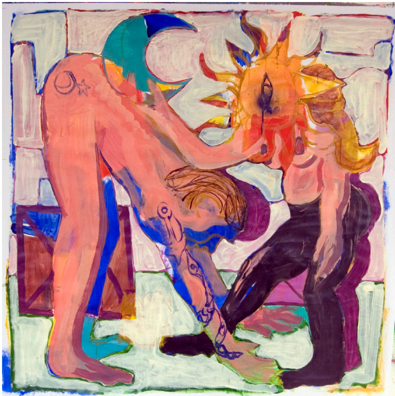
Brother Moon , 2019 acrylic on paper, 100 x 100 cm