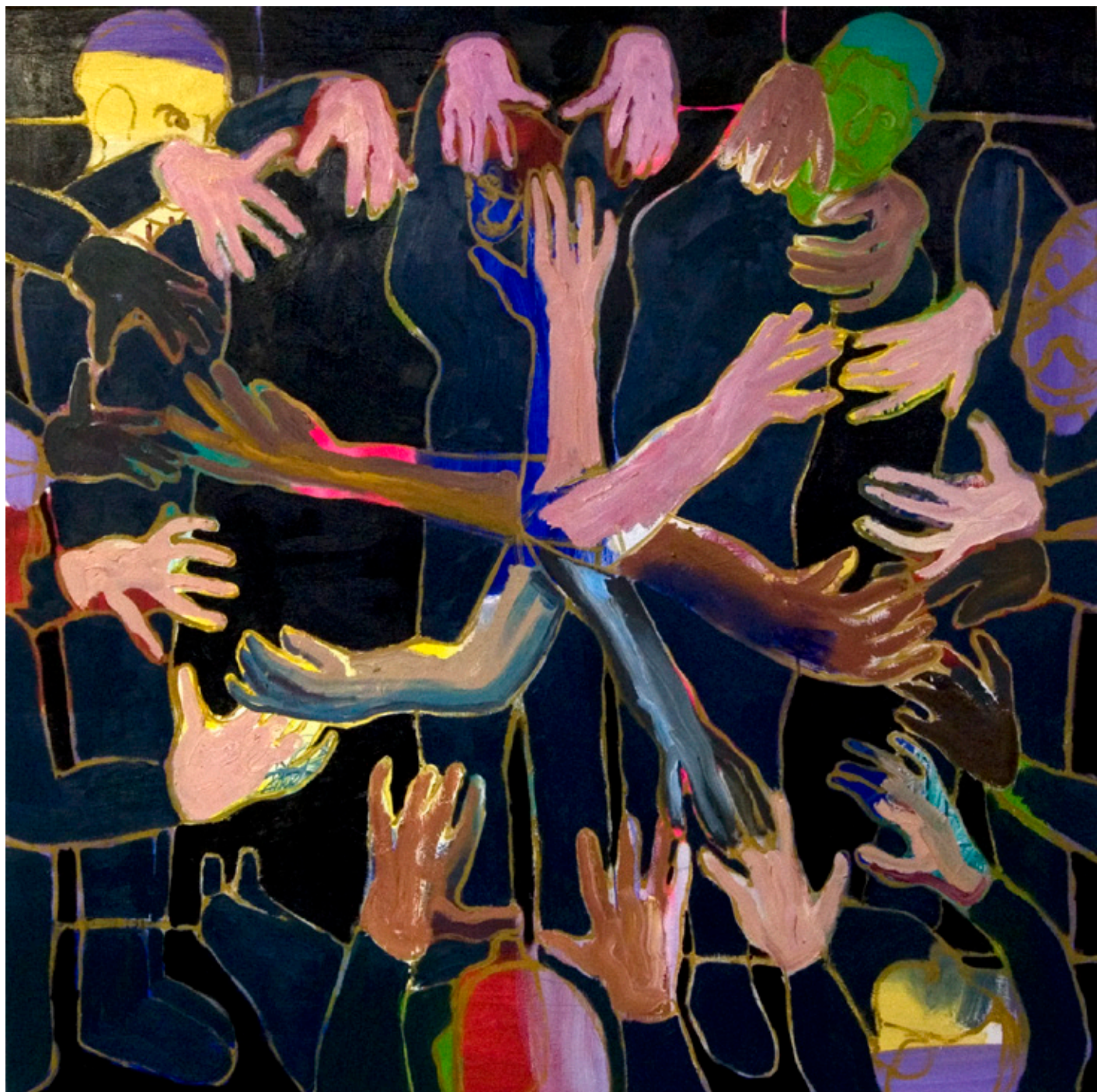
Human Clock, 2019 oil on canvas, 120 x 120 cm