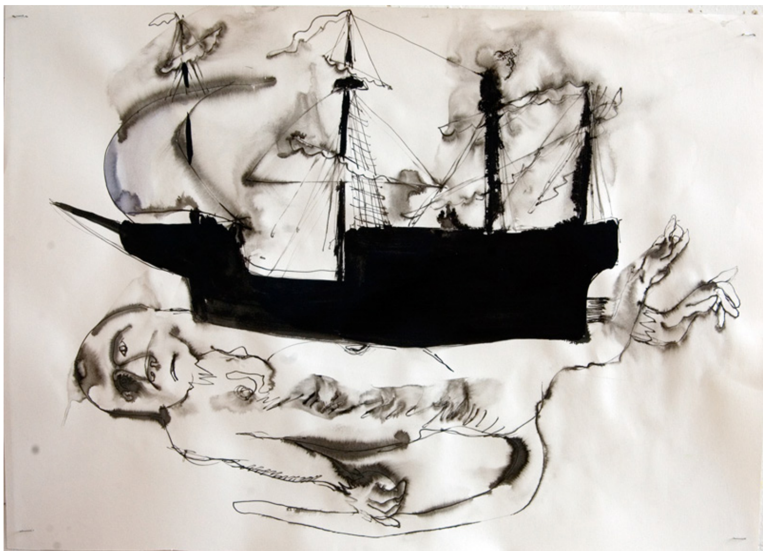
Monkey and Ship, 2018 ink on paper, 50 x 70 cm