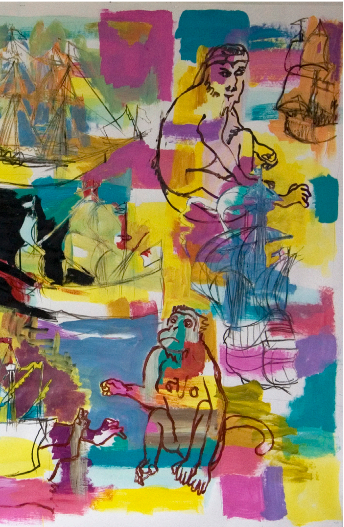
Monkeys and Ships, 2018 acrylic on paper, 150 x 200 cm