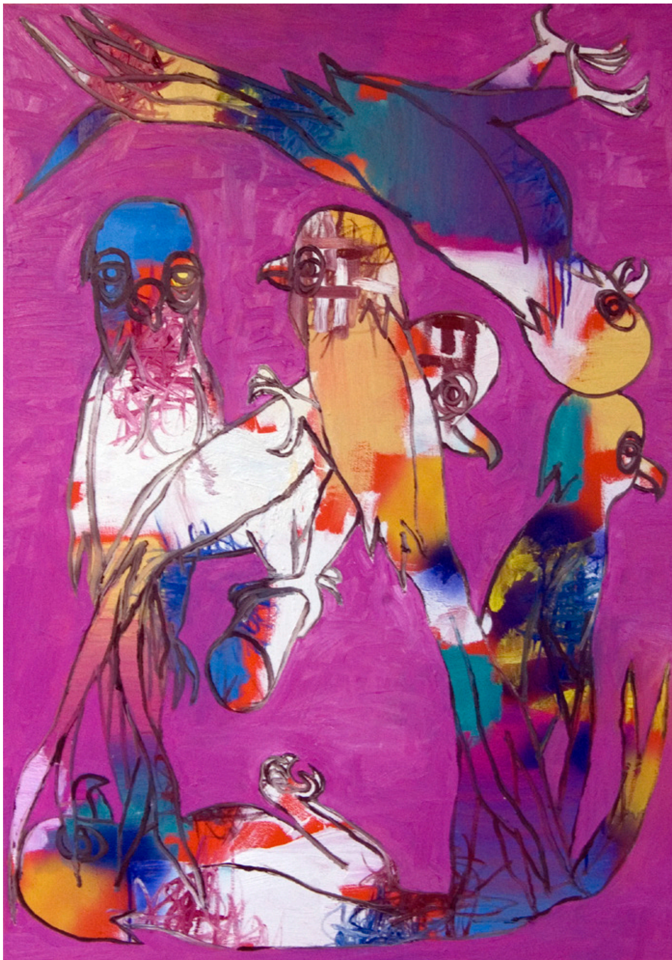
Parrots, 2018 oil on canvas, 120 x 80 cm