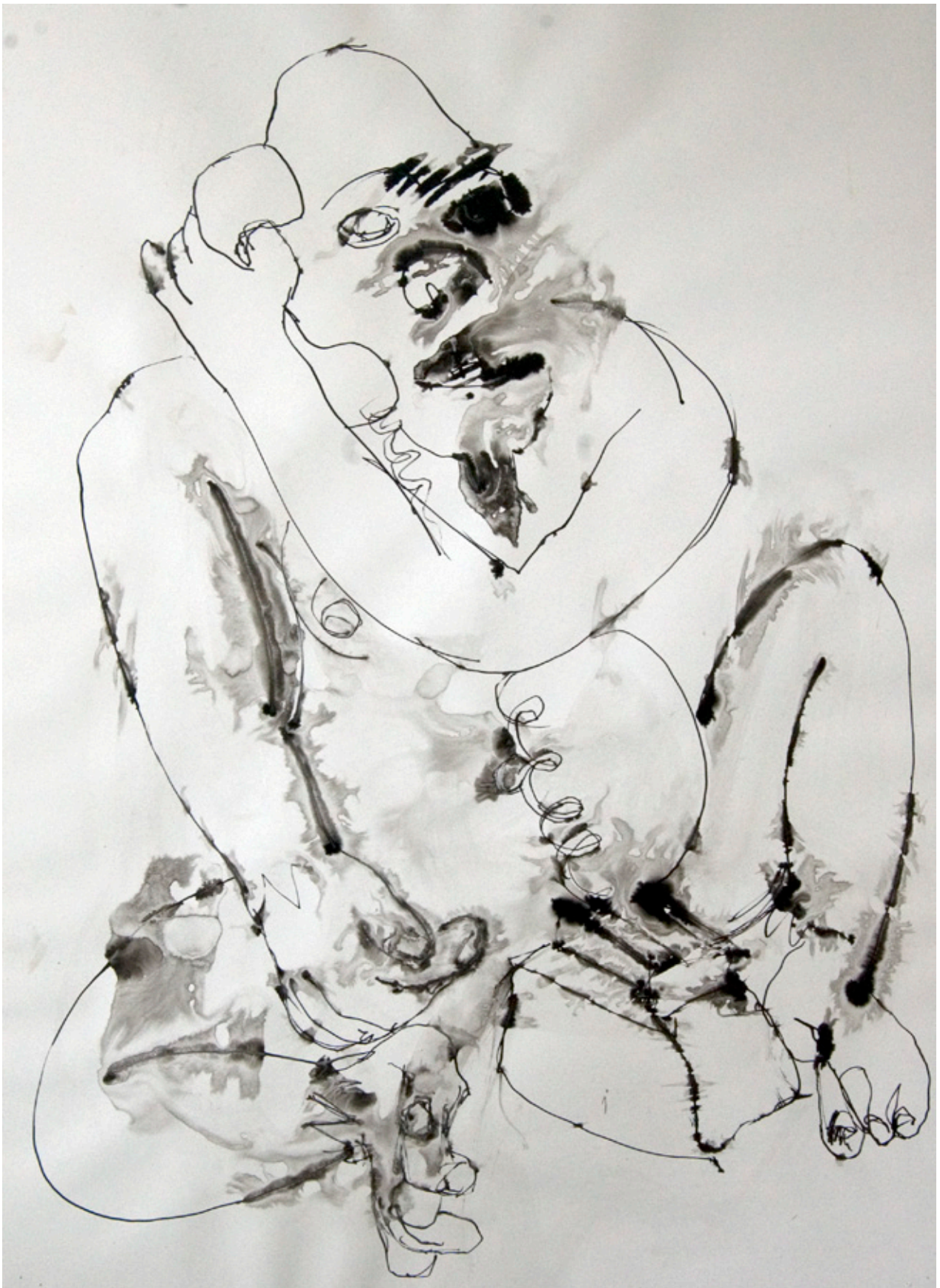
Ape on the Telephone, 2017 ink on paper, 70 x 50 cm